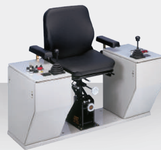
KST 7 / KST 75